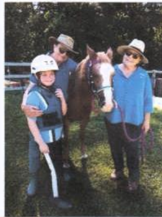
Centre right and bottom left putting smiles on our participants