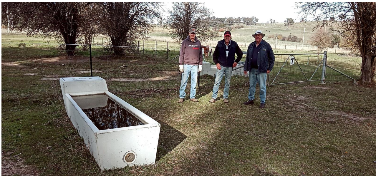
Some of the maintenance team with one of 7 new troughs that have been installed.