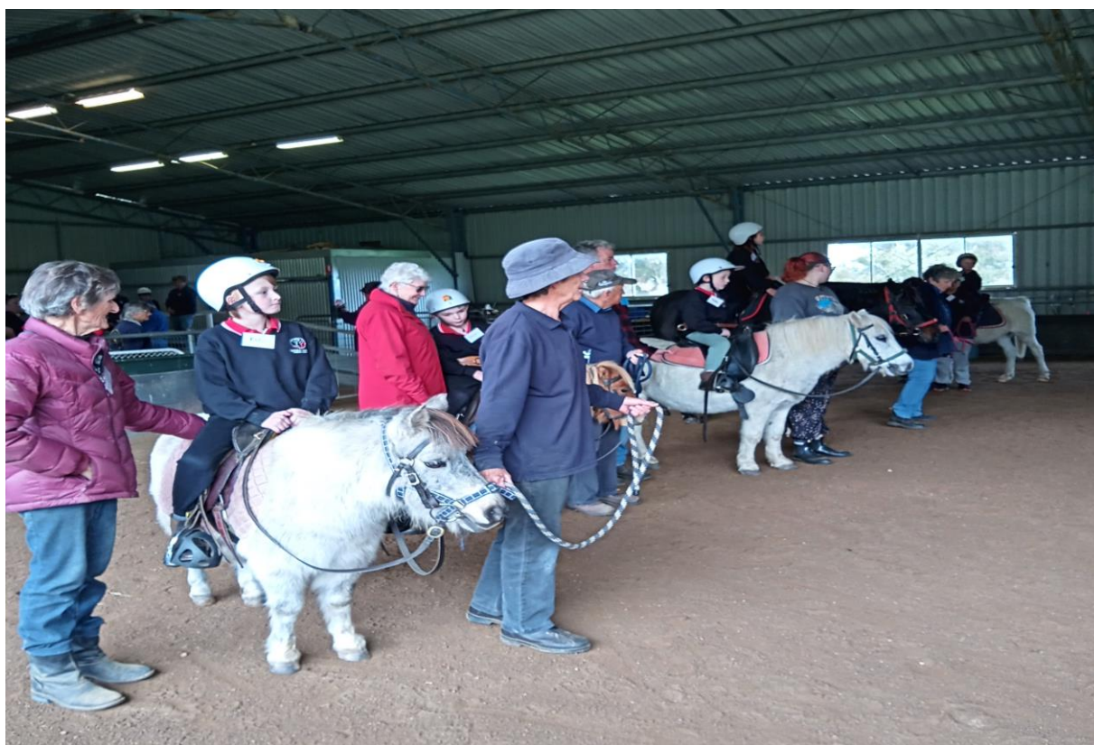
Class in troop line ready for fun activities.

Thanks so much to our community who have been generously supporting us with donations that have enabled us to finally get these things done to make our RDA experiences so much better!