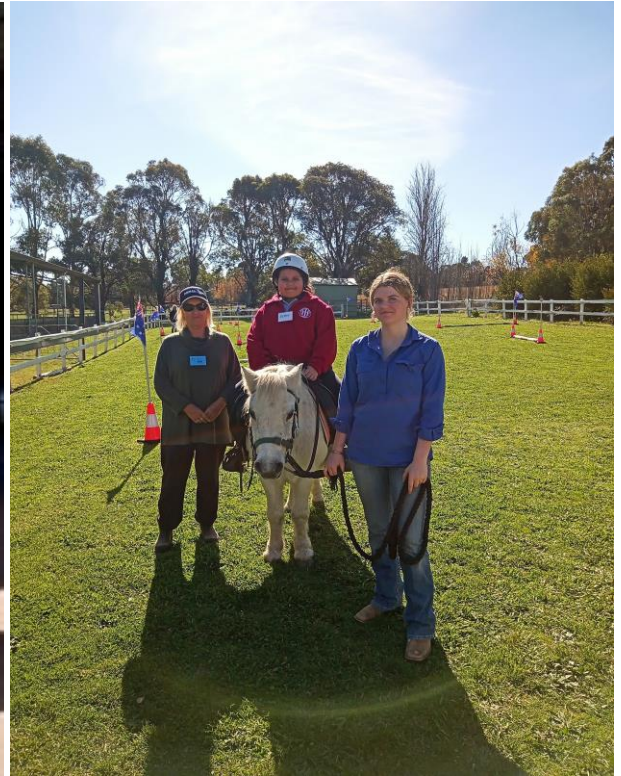
Student from Kinross Wolaroi school helping out at Orange Centre.