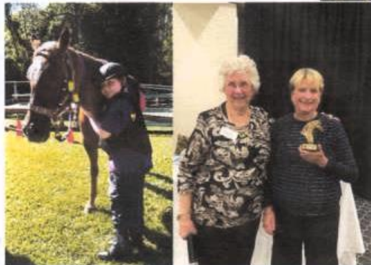
RDA Kendall receiving the trophy for 30 years of operation.

Congratulations RDA Kendall on celebrating 30 years of operation!!