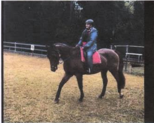
Training day at RDA Kendall